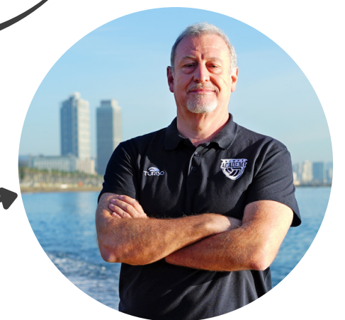
Head Coach CN Sabadell, 2x Olympian