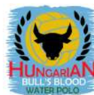
Hungarian Bull's Blood